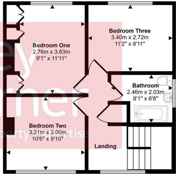
First Floor Approx 47 sq m / 501 sq ft